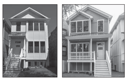
SOLD - 4015 N. Harding & 4017 N. Harding