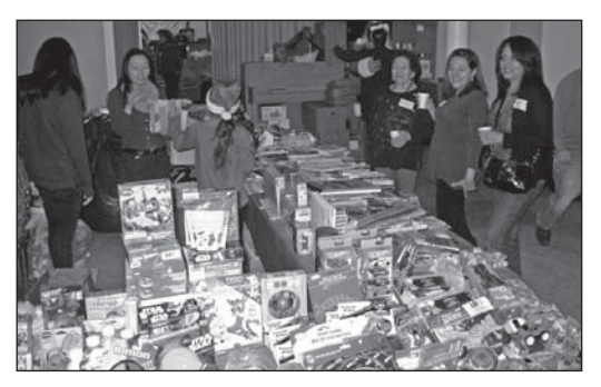
Volunteers prepare the stocking-stuffers and book table for clients during the Pantry's 2016 holiday program. Books often are in short supply.

The deadline for contributing toys is Friday, December 15th. Volunteers are needed to collect toys, organize the toy room, and help with toy distribution on December 20th. Please contact Sara Yoest at sara.yoest74@gmail.com.