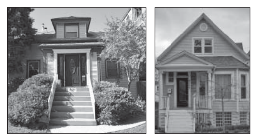
Under Contract - 4034 N. Harding & 4249 N. Hamlin