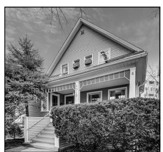
SOLD 4019 N Ridgeway