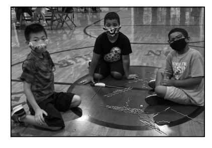
Masked up and ready to learn at MAP

its 15th year, MAP provides a safe place for kids to go after school, structured homework help, group games, clubs, enrichment programs and more. The program meets Monday through Friday at the Irving Park Lutheran Church Gym, at the corner of Harding and Belle Plaine. To learn more about the program, visit our web site.