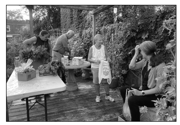
Volunteers prepare the harvest for delivery to the Irving Park Food Pantry.

The season is winding down at Three Brothers Garden and what a great season we've had! We introduced a new program called Plant a Row for the Hungry, which resulted in a bounty of additional donations from the vegetables gardens of neighbors who grew more than they could use. Thank you to all who brought over their excess, which was delivered to the Irving Park Food Pantry along with the harvest from our garden. Thanks to our garden intern, Hannah Negray for leading