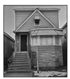
SOLD 4309 N Bernard

YES! Home prices are up 11% and the number of homes for sale is down 7%. It's still a sellers' market.