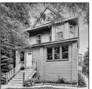
SOLD 4145 N Harding