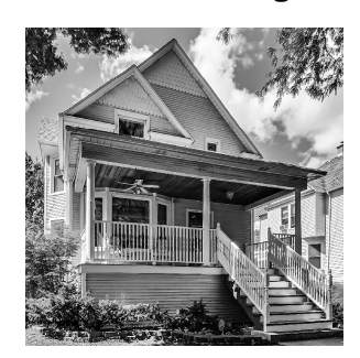
UNDER CONTRACT 4110 N Avers

Homes in our neighborhood are selling fast. And as Your Realtor, I want you to get the top sales price.