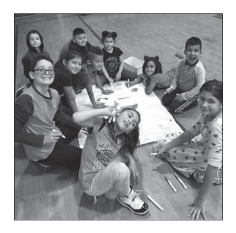
Carlson's after-school program is off to a great start!

Fall is a busy time for Carlson Community Services. Staff of the Magic After-School Place is busy preparing for our 13th year of providing high quality, affordable after-school care