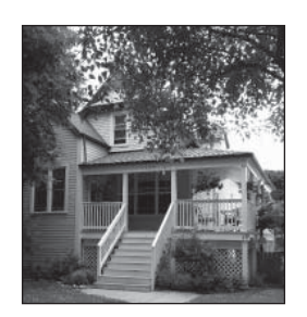
SOLD - 4239 N. Ridgeway