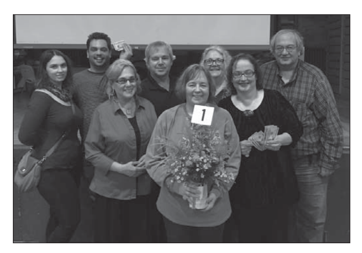
The Bole team took home the prize winnings and glory at Trivia 2016