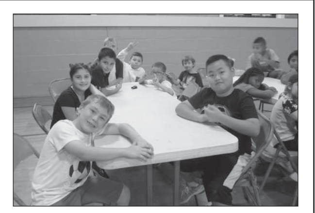
Ready for fun (and homework) at the Magic After-School Place

Carlson Community Services is a 501(c)(3) non-profit that helps at-risk kids succeed with The Magic After-School Place (MAP), provides vegetables to people in need and beautifies our neighborhood with Three Brothers Garden and makes fine arts affordable and accessible through the Irving Park Fine Arts Concert Series. For more information, visit carlsoncommunityservices.org.