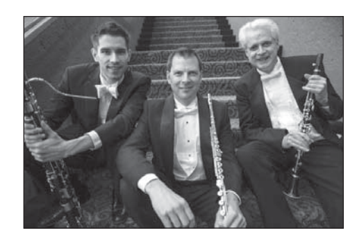
The Allegro Trio will perform on October 2nd.

affordable. Equally important, children receive homework help and tutoring, gain leadership skills and participate