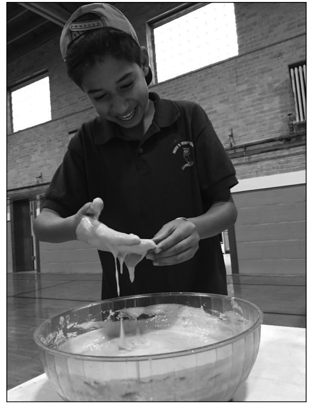
We've taken everything we've learned about having fun after school and rolled it into the MAP Summer Camp! Sign up for camp at carls oncommunityservices.org/event/map-summercamp/

Still looking for a great summer camp? The Magic After-School Place (MAP) is hosting a summer camp at June 28-July 23 from 9:00 am – 3:00 pm for 1st through 5th graders at 3938 W. Belle Plaine Ave. MAP Summer Camp will bring fun, creativity, and joy to your kiddos in a safe, socially distant environment. Expect positive character development, science experiments, small group and Olympic games, water days, arts and crafts, and more! Tuition is just $160/week and tuition assistance is available. Registration closes soon! To learn more and to register, visit CarlsonCommunityServices.org/events/. Or contact Camp Director Rachel at mapdirector@ carsloncommunityservices.org.