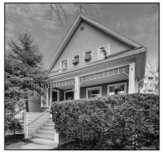
SOLD 4019 N RIDGEWAY

Homes in our neighborhood are selling fast. And as Your Realtor, I want you to get the top sales price.