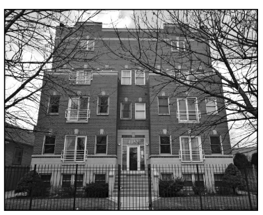
SOLD 4232 N HARDING 1N

the highest sale price, please call me for a free home consultation.