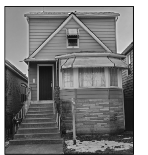
SOLD 4309 N BERNARD

is patient and answered all my questions. She's an excellent agent!"