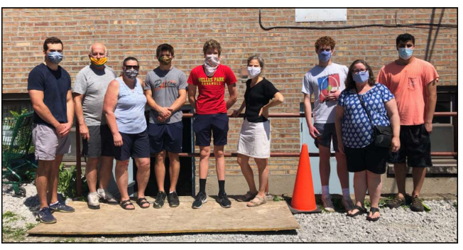
Members of the Irving Park Lutheran Church and Carlson Community Services take a breather after delivering several carloads of food to the Pantry after they learned that food deliveries to the Pantry had been disrupted.

The Pantry also has benefited from a partnership with the Chicago Police Knights Baseball Club, comprising members of the Bureau of Detectives and Youth Investigations in CAPS - 017th District Albany Park along with the Police Women's Soccer Club. They began volunteering at the Pantry in rotating groups in May and also arranged with Radio Flyer to donate three of its famous wagons to help clients take their groceries to their cars.