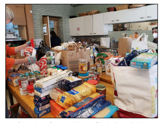
Donations from individual filled all available space at the Pantry after word of cancelled deliveries of food orders went out to neighborhood organizations.

Great support also came from the iheartirvingpark.com campaign, which raised $16,610 through its matching challenge. The consortium included the Athletic Field Park Advisory Council, Friends of Murphy, GIPNA, Hearth & Crust, Independence Park Advisory Council, Jet's Pizza,