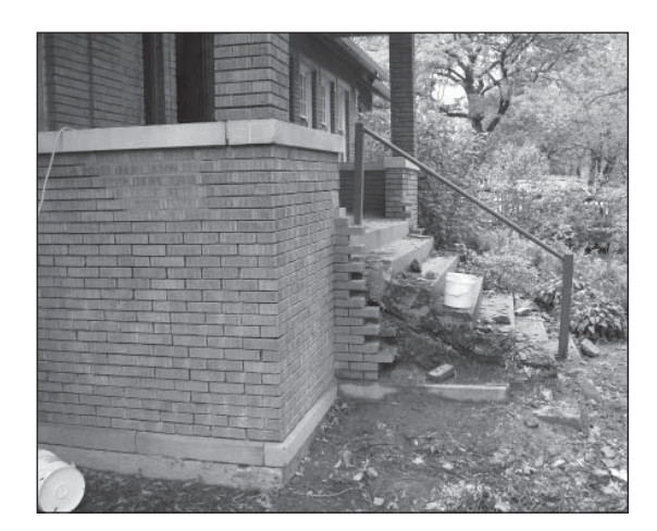
Front of Bungalow, preparation for masonry work.