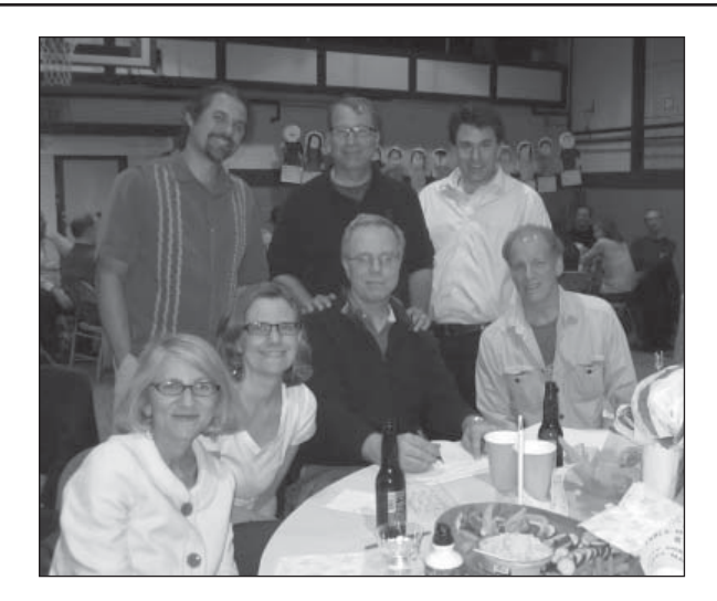
50 Shades of Grey Matter celebrate their victory at Trivia Night.

If you'd like to be added to the volunteer e-mail list, please contact Liz Mills at lizmills@carlsoncommunityservices.org, or call 773-398-6766. Or just show up on Tuesdays from 5:00 to 7:00 p.m., weather permitting. To learn more, visit www.carlsoncommunityservices.org.