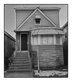
SOLD 4309 N BERNARD