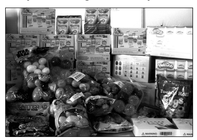
Neighbors now are making donations to the Pantry's program to provide Easter baskets to all of its clients' children up to 8 years old this month. Small toys, candy-filled eggs, stuffed animals and other basket-stuffers are requested.

The Pantry is giving Easter baskets to clients' children up to 8 years old through the end of the month (with Easter on April 4th). We are looking for donations of candy-filled plastic eggs, small games and puzzles, plush animals, party-favor-sized toys and small, wrapped candies. Please do not donate Easter baskets except the bucket-type at dollar stores to ensure consistency.