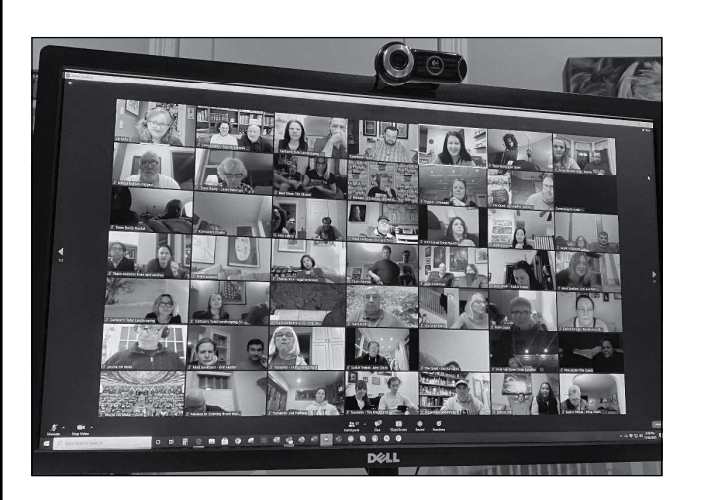
If you missed Carlson's Virtual Trivia Night in November, here's your chance to join the fun! We'll be back at it Friday, March 19th at 7 pm via Zoom. Visit carlsoncommunityservices.org for registration info.