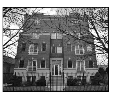
SOLD 4232 N HARDING 1N