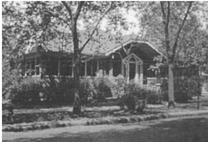
Historical photo of the Independence Park Bungalow from approximately 1936.

On September 8, the architects with Bailey Edward Architecture took us through a very exciting presentation detailing the many facets to this project. At the conclusion of the meeting, we all left knowing that our years of perseverance will pay off. This renovation to the Bungalow