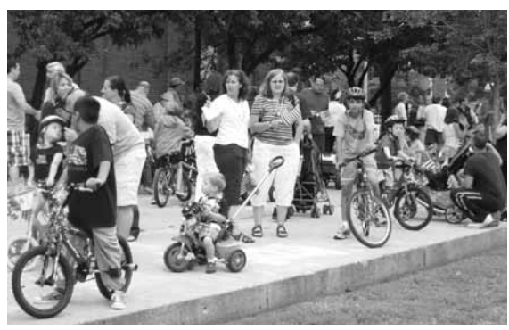
Neighbors commemorate 4th of July last year at Independence Park.

Stop by the West Walker Civic Association's table for refreshments, flags, and other patriotic giveaways. The parade