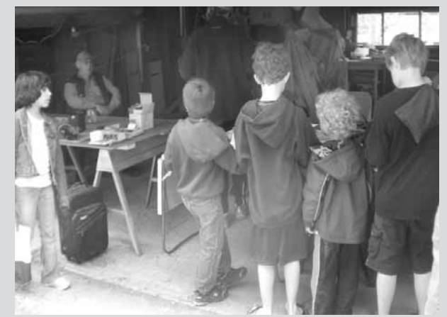
Shoppers browse at just a few of the more than 120 West Walker garages that were open for this year's community garage sale on Saturday, May 15.