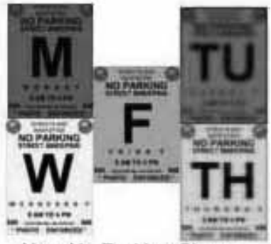
New No Parking Signs

on residential streets. Gone are the familiar orange temporary no parking signs to caution motorists not to park on that side of the street when street sweeping will take place. In their place are new temporary signs with a similar look but are instead color coded for the day of the